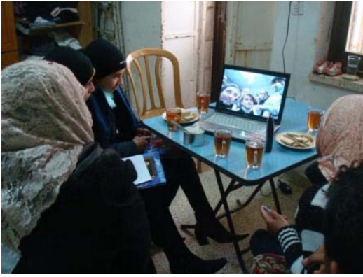
Jenin Group (left)