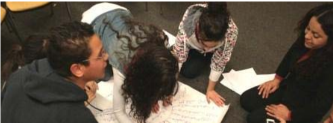
Young Journalists at a joint seminar, January 2009

have been impressed with our members, working together, as a joint Israeli-Palestinian team to cope with feelings and opinions, and to respond to changes in the situation. We have seen the impact of our programs on participants who have gone through a long-term process, as they demonstrate commitment to building strong and sustainable Israeli - Palestinian partnership. Witnessing their commitment strengthens our resolve to continue our work promoting acquaintance, understanding, democratic values and human rights towards a just and lasting peace in the region.