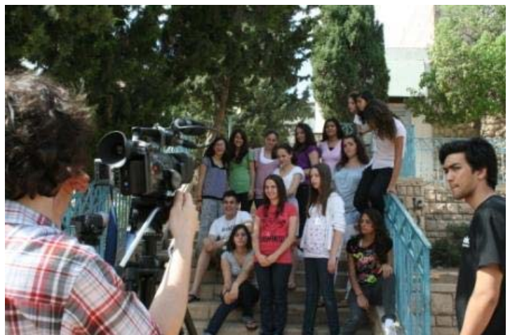
Filming the music video during PointBlank seminar

The 2008-09 "junior" young editorial board is made up of Jewish youth from Givatayim (metropolitan Tel Aviv area), OPT Palestinians from Jenin area and Palestinian citizens of Israel from Tamra (Galilee) and is continuing the process they began in 2007-08. After building preliminary acquaintance through SIG meetings, letter exchanges, and joint seminars, the group has begun taking a more active role in the production of the bi-lingual youth magazine, a role which they will continue and strengthen in the coming year. In recent months they dealt with challenging issues and current events, including the January 2009 Israel – Hamas war. During the war they demonstrated great maturity, which is evidence of the process they have gone through. During their January joint seminar, which occurred at the height of the violence, the Tamra and Givatayim groups met together and conducted a video-conference with their peers from Jenin because the parents and society of the Jenin youth felt it was inappropriate to travel to Tel Aviv at the time. All three sub-groups exchanged many letters throughout the war, which then became the basis for much of the latest issue of the magazine.