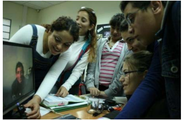
Tamra and Givatayim Groups (right)

The group continued with regular SIG session and met in joint meetings in April and June 2009 in Beit Jala and Tel Aviv, respectively. These joint meetings furthered their process as a group in dealing with complex and important issues, and also served as important time for them to strengthen their relations as friends, playing and socializing during the breaks.