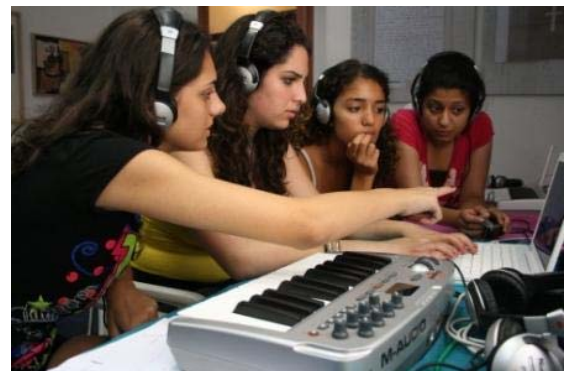
Participating in the music and video seminar, June 2009

Armed with their new music and video experience, along with their years of print journalism, these youth will continue their process of building trust and partnership while creating interesting and important video products which we will use in our other programs in the coming year. We believe the video program will further their growing interest in social activism, giving them the tools to reach their peers and the wider community and promote change in their schools, and societies.